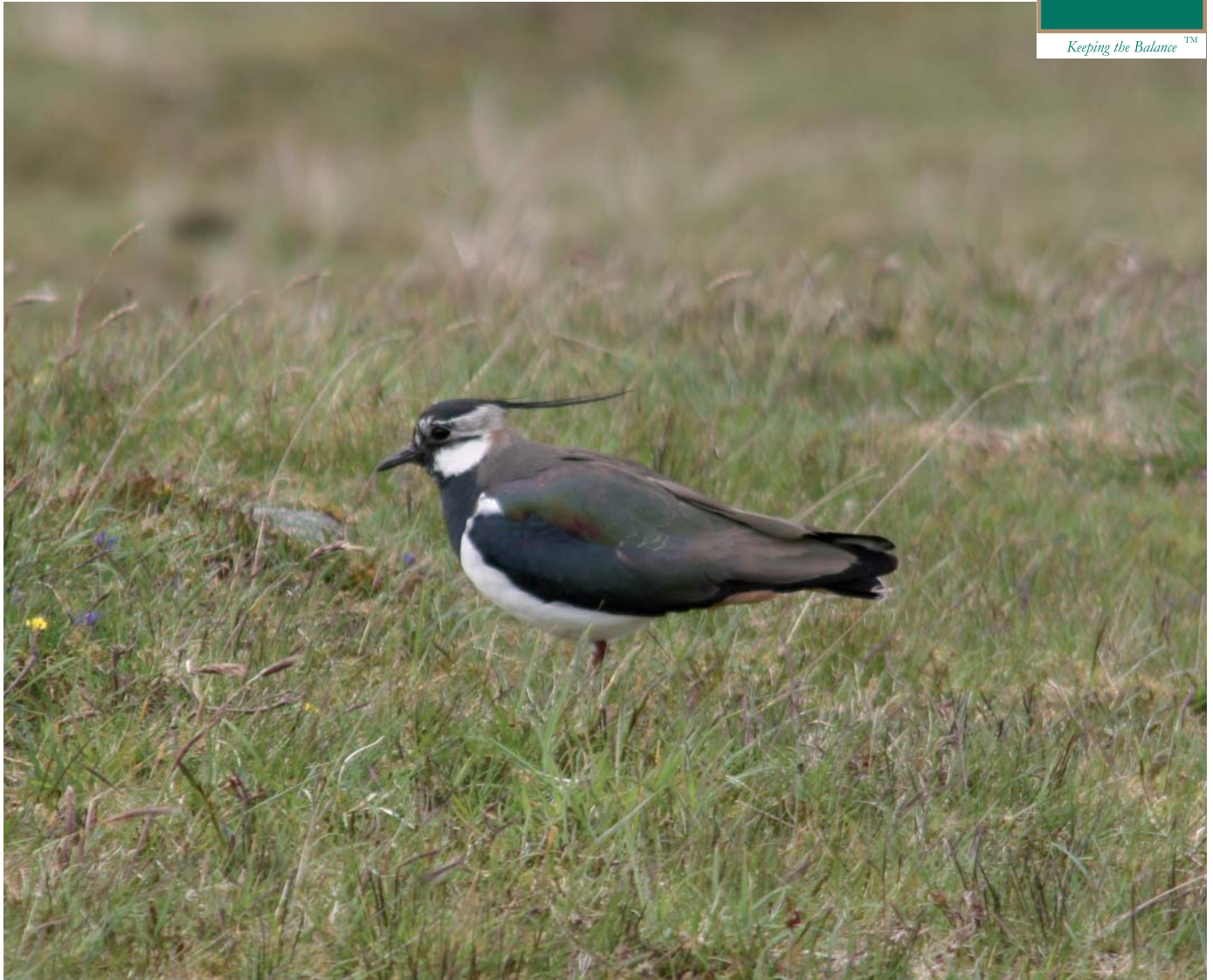
Breeding numbers of lapwings can fluctuate hugely. Like all the species pictured, the lapwing is on the Farmland Bird Index.

AS THE SHOOTING SEASON DRAWS TO A conclusion and your minds turn to a few days off and next year's layers, the postman will arrive with a package for all the NGO gamekeeper members. It will contain a survey for you to fill in and return.